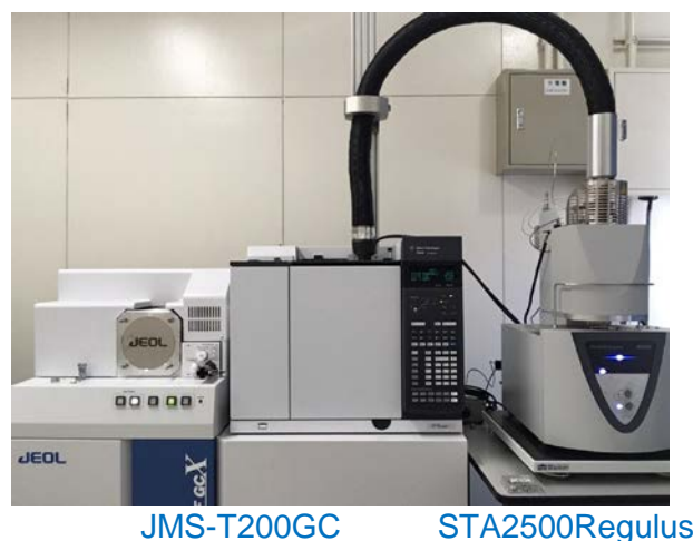
Fig. 1 TG-TOFMS system

The TG-TOFMS data showed that the measurable m/z range greater than 1000Da which is wider than ordinary TG-QMS and can be used for the measurement of synthetic polymers in the oligomer region.