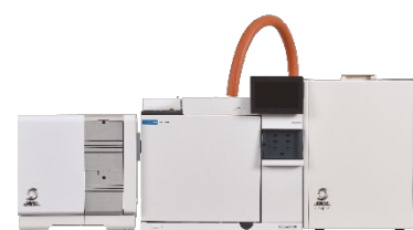
JMS-Q1600GC UltraQuad™ SQ-Zeta w/ MS-62071STRAP

A headspace sampler MS-62071STRAP and a GC-QMS JMS-Q1600GC UltraQuad™ SQ-Zeta were used for the measurements. Data were acquired using the EI method and the low ionization energy EI method as a soft ionization (SI) method for the components collected using the trap mode. Samples were 2 mL of coffee extracted from commercially available instant drip-type packets (A: fresh coffee immediately after opening, B: oxidized coffee for 5 days after opening) and measured by the EI (n=5) and SI (n=1) methods for components extracted into the headspace by heating. Comparison of two samples (differential analysis between A and B) was attempted using the measurement data obtained under the measurement conditions shown in Table 1. Please refer to MSTips No. 348 for the function of differential analysis.